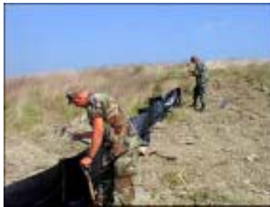
Silt fence maintenance