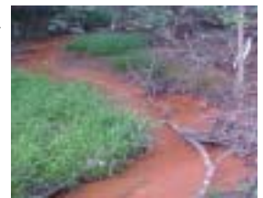
Sediment-filled creek downstream of a construction site.

In just one rain event, poor erosion & sediment control practices can contribute nearly a ton of sediment per acre to a